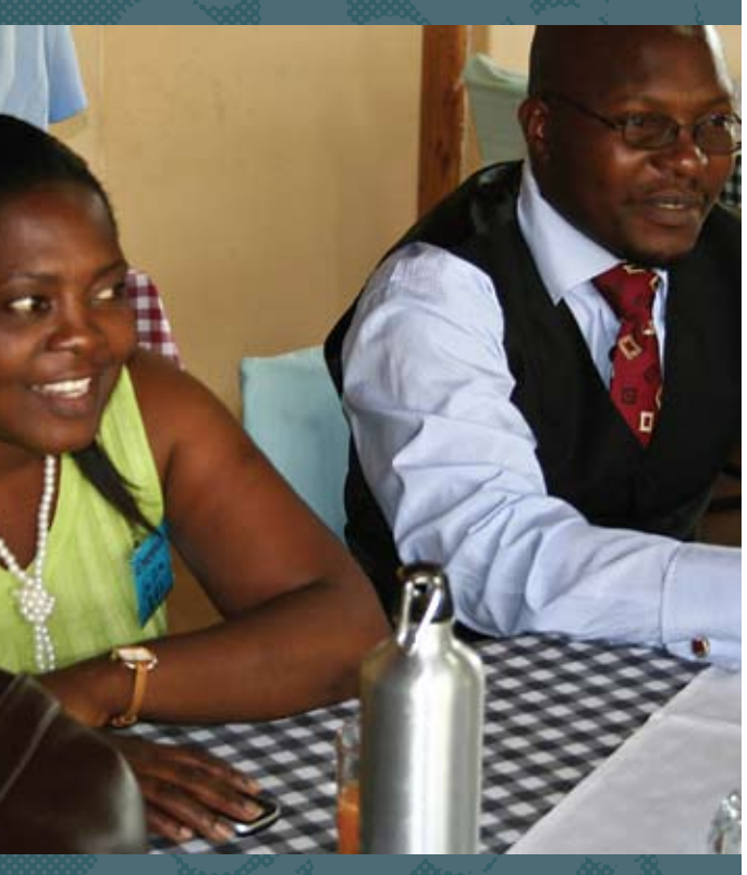
BCA staff at the first OER workshop.