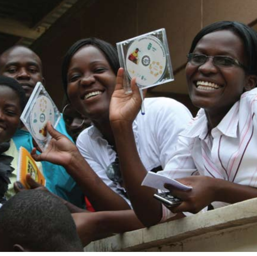
Midwifery students in the pilot, show off their course materials CD-ROM.