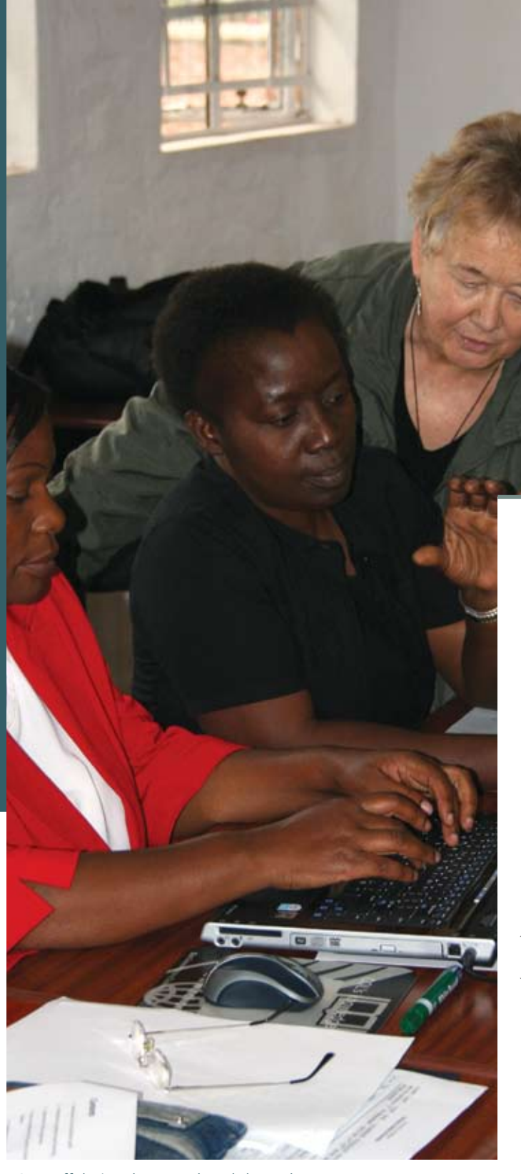
KCN staff during the second workshop, Blantyre.