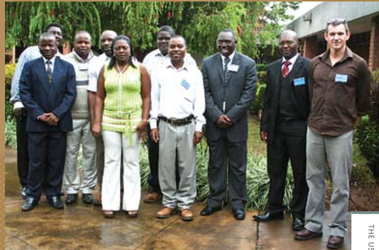
BCA OER Materials Development Team 1st Workshop April 2009